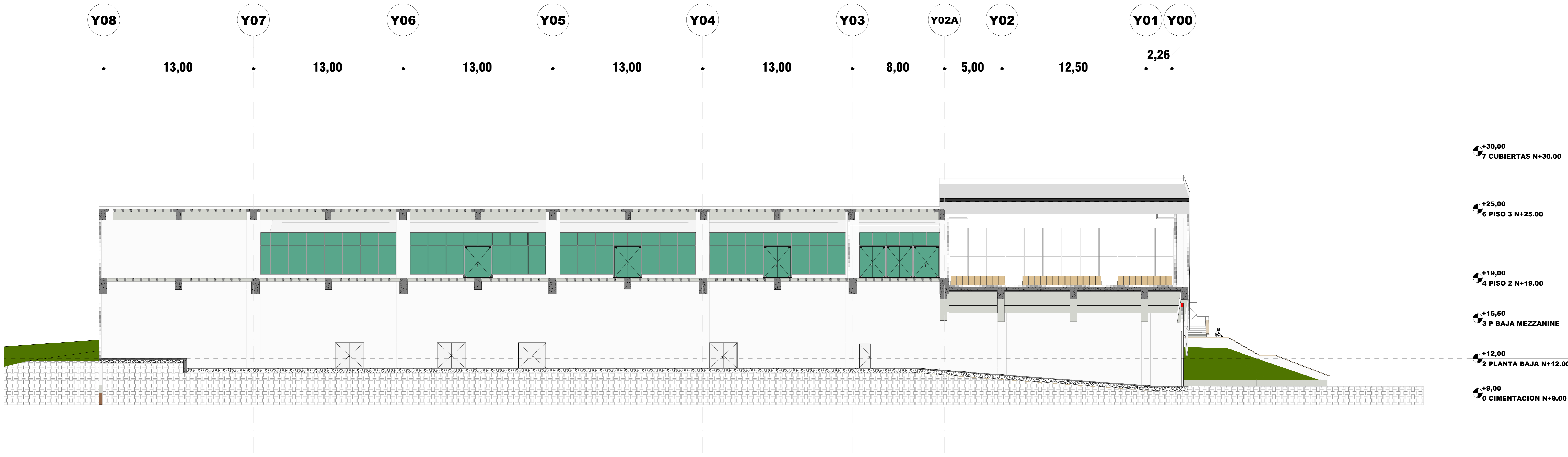
J CORTE E-E' 1:125